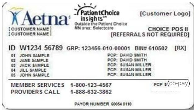
Patient Choice Insights Front of card